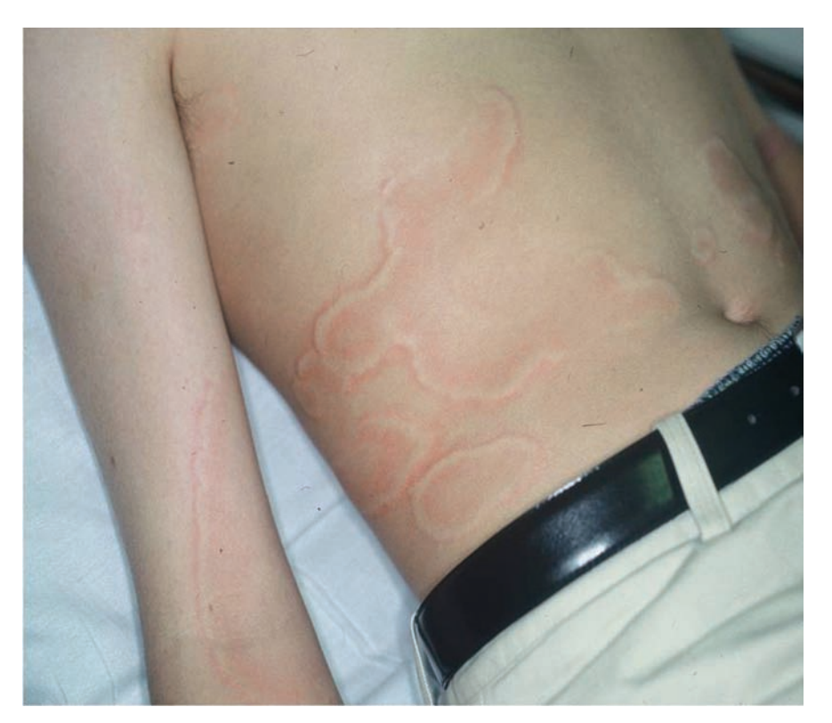
Fig 1. Urticarial rash in a young man with Katayama fever following a trip to Lake Malawi.<sup>6</sup>

Microscopy for eggs (in urine or stool) is usually negative at this early stage in