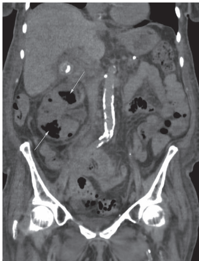
Fig 2. CT scan with unenhanced coronal section images with arrows showing intra-substance gas within the right kidney.