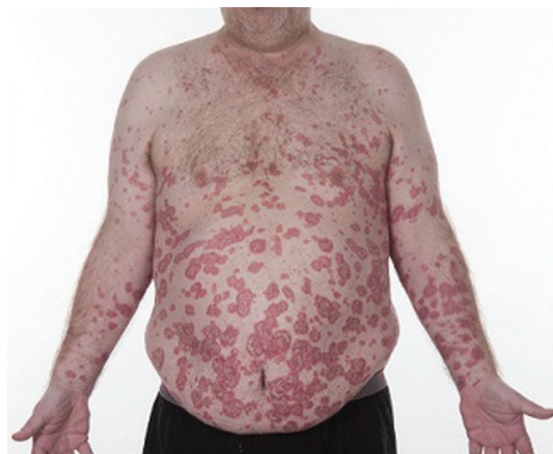
Fig 1. Severe chronic plaque psoriasis.

In the UK, there are four biological agents approved by the National Institute for Health and Care Excellence (NICE) for the treatment of chronic plaque psoriasis. 6 These are the TNF- \alpha antagonists etanercept, adalimumab and infliximab, and the