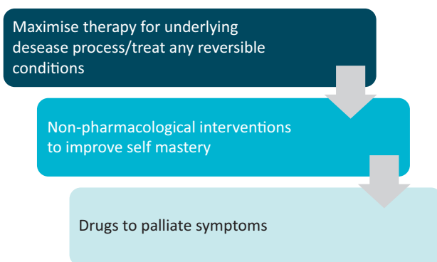
Fig 2. Management of breathlessness in advanced disease.