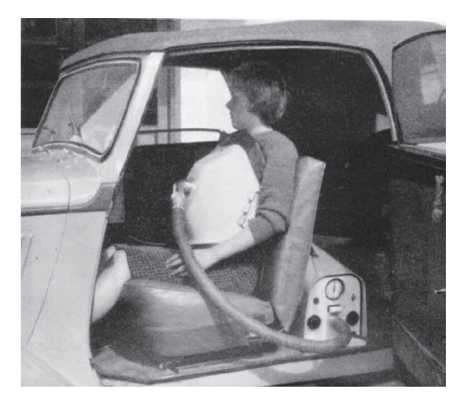
Fig 2. Cuirass shell ventilator.

The ability to support temporarily and, in some cases, replace the function of multiple-organ systems in the face of critical illness and injury is the core capability that underpins intensive care medicine. As a result, medical interventions in intensive care are more numerous and more invasive than those in the general ward setting, and the physiology of the critically ill patient is often fragile. This leaves ICU patients particularly vulnerable to iatrogenic harm.