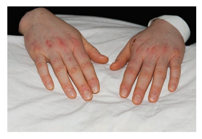
Fig 1. Gottrons papules: erythematous papules overlying the metacarpal and interphalangeal joints.

was performed, which excluded a pulmonary embolus. Myositis-associated antibodies were also measured.