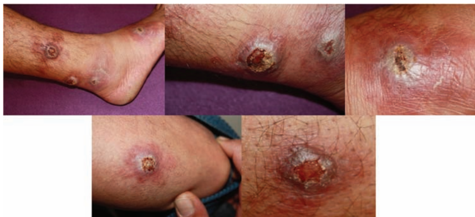
Fig 2. Multiple ulcerated lesions characterised by indurated raised margins, surrounding erythema and central adherent crusts on extremities.

As there were multiple lesions and possible complications associated with eyelid involvement, systemic therapy was planned and intramuscular meglumine antimonate (Glucantime, Aventis, France) in a dose of 20 mg/kg/body weight was started. The patient tolerated the therapy well with mild symptoms of upper respiratory infection and arthralgia. After 20 doses of intramuscular Glucantime, all lesions, including those located on the eyelid, improved significantly (Fig 4) and the therapy was stopped. Clinical follow up was planned for the residual lesions and within two months of the follow up, most of the lesions, including the one on the eyelid, improved and were almost clear, except for the three lesions located on the right leg, which needed further local therapy in order to accelerate the healing process.