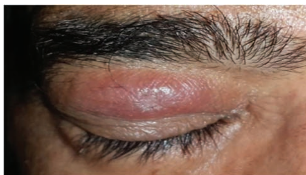
Fig 1. Erythematous indurated plaque with central depression on the right upper eyelid.

KEYWORDS: eyelid, leishmaniasis, sandfly, ulcer