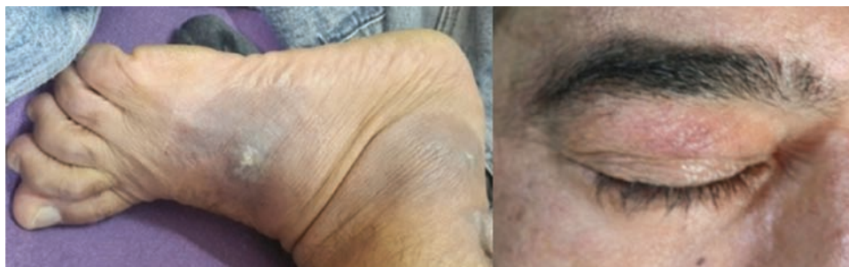
Fig 4. Clinical improvement after 20 days of 20 mg/kg/day intramuscular meglumine antimonate treatment.

the disease and further complications. 1,10 Treatment choices include local and topical therapies (cryotherapy, intralesional injection of pentavalent antimony derivatives, local heat therapy and various topical paromomycin preparations), oral or parenteral systemic therapies. 10 Local and topical therapies are the initial choice for the uncomplicated cutaneous lesions. 10 Lesions on cosmetically and functionally important areas, such as nose, ear, eyelids, fingers and toes, those associated with lymphangitis, multiple and persistent lesions, those effecting immunosuppressive patients and lesions persisting after clinical failure with local therapies require systemic treatment. 10 Most commonly used systemic agents are parenteral (intramuscular or intravenous) pentavalent antimony derivatives: sodium stibogluconate and meglumine antimonate. 10 Their efficacy is well established if they are given in adequate doses and for an adequate period. 1 The recommended dosage is 10–20 mg/kg/day for 10–20 days. 10 Because of the eyelid involvement and presence of multiple lesions, we treated our patient with 20 mg/kg/day meglumine antimonate for 20 days. The lesions responded well to the treatment, and during follow up, the lesions had almost cleared and no relapse or ocular complications were observed.