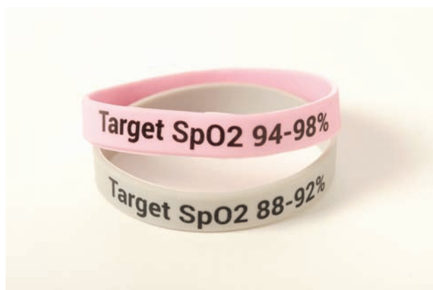
Fig 1. Colour-coded silicone wristbands. Pink = target oxygen saturation of 94–98%; grey = target oxygen saturation of 88–92%.

The quality improvement project ran for 16 weeks, supported by the East Midlands Respiratory Programme and funded by a 2014 East Midlands Academic Health Science Network innovation award. Ethics approval and informal consent was not required as this project was run as a quality improvement project. However, a risk assessment was carried out at each site and the project approved by the relevant local governance committees. A key governance issue raised was potential overlap of the colours proposed with existing bands at each of the hospitals involved. Following discussions with local governance committees, the colour choice of the wristbands was agreed across the three sites (Fig 1). Methods for data collection on adverse events were also agreed.