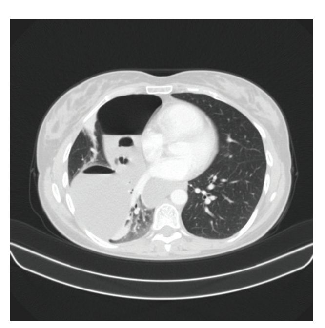
Fig 1. Computed tomography of the thorax demonstrating a large thin-walled fluid collection in the region of the right major fissure. The collection extends into the right paracardiac and posterior mediastinal regions. Lung adjacent to this is atelectatic, but the remaining parenchyma is normal.

Authors: <sup>A</sup>respiratory registrar, Manchester University NHS Foundation Trust, Manchester, UK; <sup>B</sup>respiratory senior house officer, Manchester University NHS Foundation Trust, Manchester, UK; <sup>C</sup>consultant histopathologist, Manchester University NHS Foundation Trust, Manchester, UK; <sup>D</sup>consultant radiologist, Manchester University NHS Foundation Trust, Manchester, UK; <sup>E</sup>consultant respiratory physician, Manchester University NHS Foundation Trust, Manchester, UK and The University of Manchester, Manchester, UK