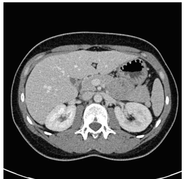
Fig 1. Computed tomography demonstrating left renal vein compression between the superior mesenteric artery and aorta.

Definite diagnosis of nutcracker syndrome was confirmed 6 years after presentation, with selective left renal vein venography measuring a renocaval pullback gradient of 7 mmHg (<1 mmHg in control patients; pressure gradient of 3 mmHg is indicative of renal