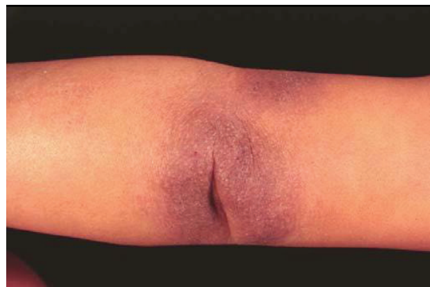
Fig 2. Lichenified skin at a site of chronic eczema in dark skin, showing hyperpigmentation. Inflammation is not evident.

responses. The former is demonstrated by increased permeability of the epidermis to water (resulting in dry skin) and the latter by a specific predisposition to development of type 2 immunity as a consequence of exposure to multiple antigens in the skin. The precise link between the two remains unclear, but the concept of the disrupted barrier providing the increased allergen exposure and subsequent Th2 primed immune responses accounting for the associated allergic sensitivity is widely accepted. 2,3,6,7 Importantly, there is no evidence for an altered systemic immune response in AD, although rarely specific primary immunodeficiencies (such as hyper-IgE syndrome) can present with atopic dermatitis-like features. Genome-wide association studies led to the discovery of multiple genetic loci for AD susceptibility, but the most replicated and strongest of all associations is with the gene encoding filaggrin ( FLG ). Subsequently, loss-of-function FLG mutations have been identified in populations across the globe and are associated with increased risk of AD. FLG mutations, and are carried in approximately 10% of all Europeans, and individuals carrying these show an increased risk of development of AD (odds ratio (OR) 3.39–4.78). Filaggrin is a skin barrier protein expressed in the outer layers of the epidermis and all mutations reduce expression, and are associated with a more severe phenotype and early onset disease that persists into adulthood.