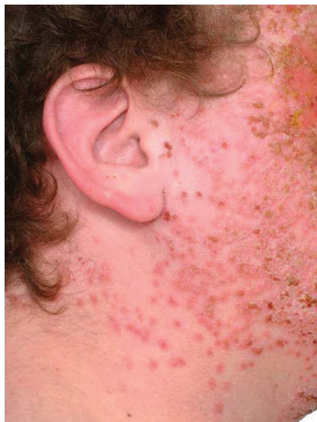
Fig 3. Diffuse spread of small vesicles across the face with crusting and scaling in a patient with atopic dermatitis.

Patients with AD may also present due to their atopic comorbidities or due to unrelated disease. As inpatients, concurrent illness, addition