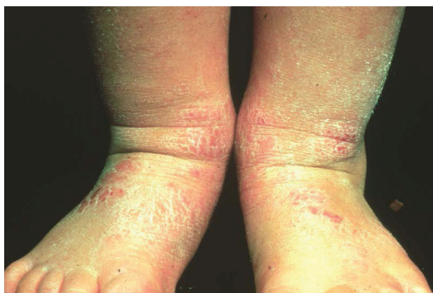
Fig 1. Lichenified (thickened), scaly skin over flexural sites of chronic eczema. Inflammation is evident.

Patients with AD have a genetic predisposition to a disrupted skin barrier and a propensity to make aberrant cutaneous immune