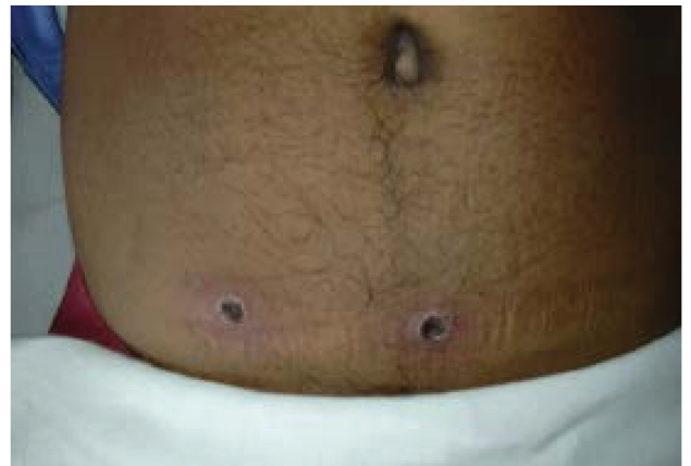
Fig 2. Eschars: the characteristic entry wound of scrub typhus and some spotted fever group rickettsioses.

depends on the region. 4 Therefore, it is important to recognise both the typical and atypical manifestations of rickettsial infection in each region to promptly diagnose and treat these infections, as they can be associated with significant morbidity and mortality. Rickettsial infections are a major cause of non-malarial febrile illnesses among returned travellers to endemic areas. 3,5