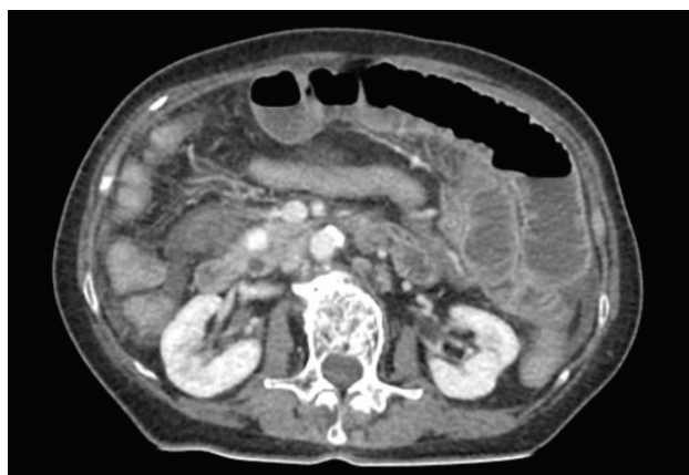
Fig 1. CT abdomen pelvis. Dense focus in periampullary region which was either duodenal or pancreatic in origin.

She was subsequently transferred to a community hospital for further rehabilitation. During her stay, she was found to have recurrent hypoglycaemia which typically occurred in the morning. During her episodes of hypoglycaemia, she remained asymptomatic. Her renal function, liver panel, infection markers, thyroid function and cortisol level were normal, as was a drug screening test. Her serum C-peptide was 1.20 (reference range 0.78–5.19 ug/L), serum insulin was 0.26 (reference range 1.0–30.0 mU/L) and fasting plasma glucose was 2.3 (reference range 3.9–6.0 mmol/L). Previous CT abdomen pelvis (Fig 1) done for intestinal obstruction was found to have a dense focus in the periampullary area which was either duodenal or pancreatic in origin. The lesion was further characterised by an MRI pancreas (Fig 2), which showed the presence of a pancreatic head lesion likely due to a