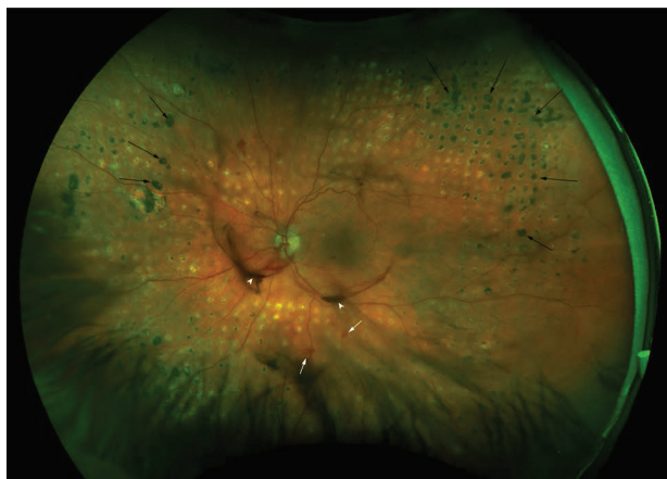
Fig 2. Ultra-widefield fundus photography of an eye with active proliferative diabetic retinopathy showing laser photocoagulation scars (black arrows), new vessels elsewhere (white arrows) and a vitreous haemorrhage (white arrowheads).

Over the past few years, the diagnostic accuracy of artificial intelligence systems in identifying DR have been shown to be