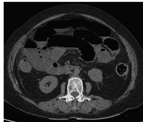
Fig 1. Axial non-contrast computed tomography demonstrating luminal dilatation, some wall thickening and interloop fluid suggesting small bowel ischaemia and possibly areas of infarction.

Authors: A internal medicine trainee 3, Barnet Hospital, London, UK; B junior clinical fellow, Barnet Hospital, London, UK; C consultant physician in respiratory and general internal medicine, Wexham Park Hospital, Slough, UK