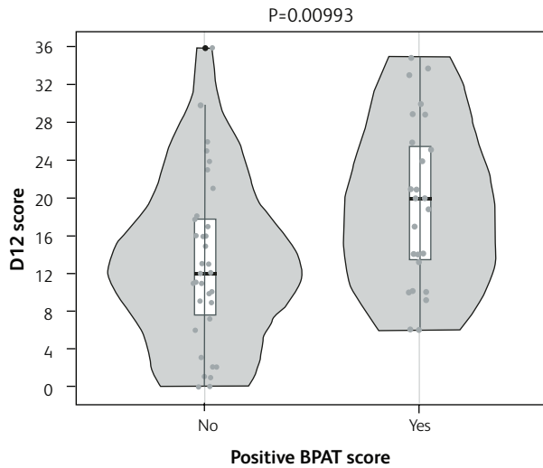
Fig 2. D12 questionnaire scores for breathlessness in patients with/without positive BPAT score indicative of likely breathing pattern disorder. Violin with box-and-whisker plots of D12 questionnaire scores for patients with BPAT score \geq 4 , positive for likely breathing pattern disorder, and those patients with BPAT score < 4 , negative for likely breathing pattern disorder. P value for Wilcoxon-Mann-Whitney test.

questionnaire than those without BPD. However, there was no difference between the groups on a 10-point breathlessness scale, which may reflect the limitations of a simple 10-point scale to assess any complex symptom.