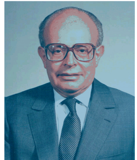
Fig 1. Michel Mirowski MD (1924–90).

ICDs have at least one lead in the right ventricle for pacing, sensing and defibrillation. There may also be a second lead or coil in the superior vena cava to improve the defibrillation threshold. Additional leads can be placed in the right atrium for dual chamber pacemaker indications or to help in the detection or discrimination of arrhythmias. In