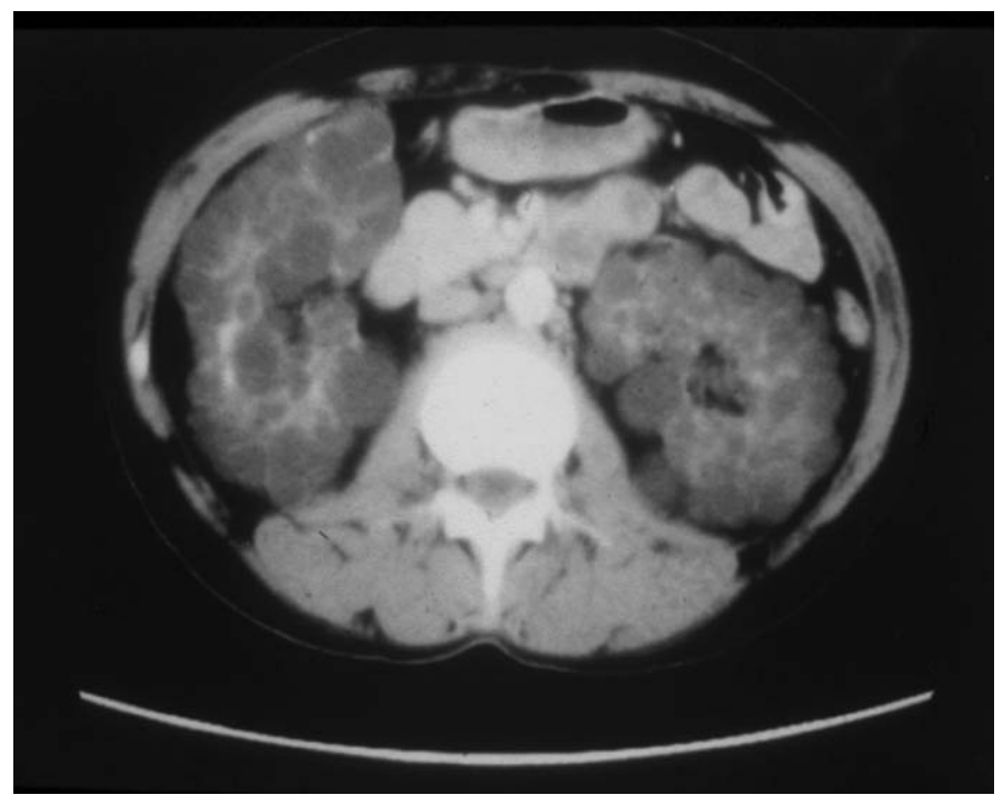
Fig 3. Computed tomography scan showing bilateral enlarged polycystic kidneys.

therapy for cyst haemorrhage and haematuria as bleeding is normally self-limiting and resolves within days.<sup>15</sup> Further investigation to exclude malignancy may be considered if episodes are frequent and/or prolonged (especially in patients over 50 years old) or if other systemic symptoms are present. Rarely, haemodynamically significant bleeding can occur, requiring hospital admission, transfusion and computed tomography with or without angiography. Persistent haemorrhage may require segmental arterial embolisation (coils) or nephrectomy.