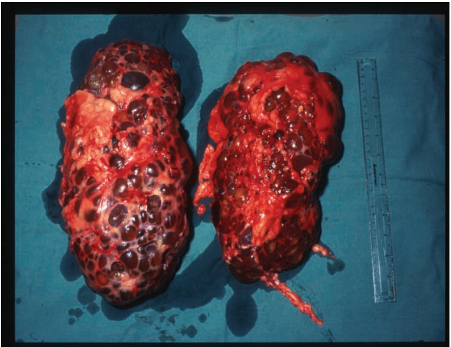
Fig 1. End-stage autosomal dominant polycystic kidneys.

viduals have recently been reported (Table 2).<sup>8</sup> The previously used criteria had a sensitivity of 100% in PKD1 patients aged 30 years or older but false-negative rates for PKD2 (23%) and PKD1 (5%) in younger patients. Where the family history is unknown or negative, these new criteria may not apply and mutation analysis may be indicated for either disease exclusion or diagnostic purposes.<sup>8,9</sup> Clinically, the presence of bilateral enlarged cystic kidneys with hepatic cysts and absence of positive extrarenal manifestations (suggesting an alternative cystic disease) make the diagnosis highly probable.