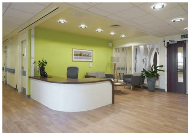
Fig 2. Academic Palliative Care Unit, Liverpool: hotel style reception to provide a calmer and more welcoming experience.

There are four single rooms and two four bed bays, alongside dedicated family space.