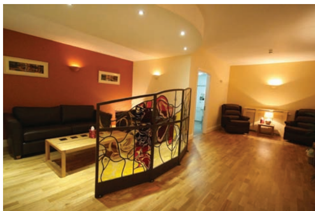
Fig 1. Wansbeck oasis: relatives' accommodation to rest and recharge away from hospital wards.

The RLBUHT APCU incorporated the views of clinical staff, patients and families in to the design of the unit. A standard ward footprint was used within the main hospital building, but through using dedicated interior designers, particular features were created to enhance the environment: a hotel-style reception instead of a nurses' station, a family and friends' suite, complementary therapies suite and a separate clinical hub, in a setting of carefully chosen colour schemes and artwork to retain an air of calm (Fig 2).