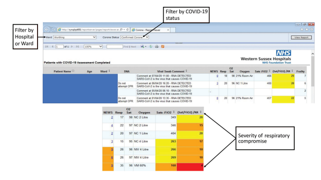
Fig 2. COVID-19 report interface. This live dashboard highlights location of patient, test status (suspected, awaiting test, confirmed), latest physiological variables and clinical frailty scale assessment.