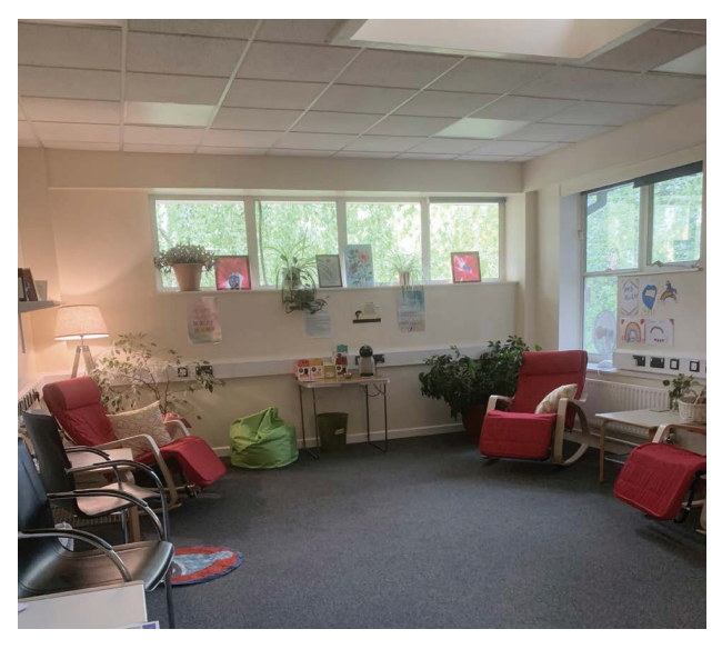
Fig 3. Wellbeing hub at Medway NHS Foundation Trust.

Through surveys, staff have reported that such schemes are highly valued.