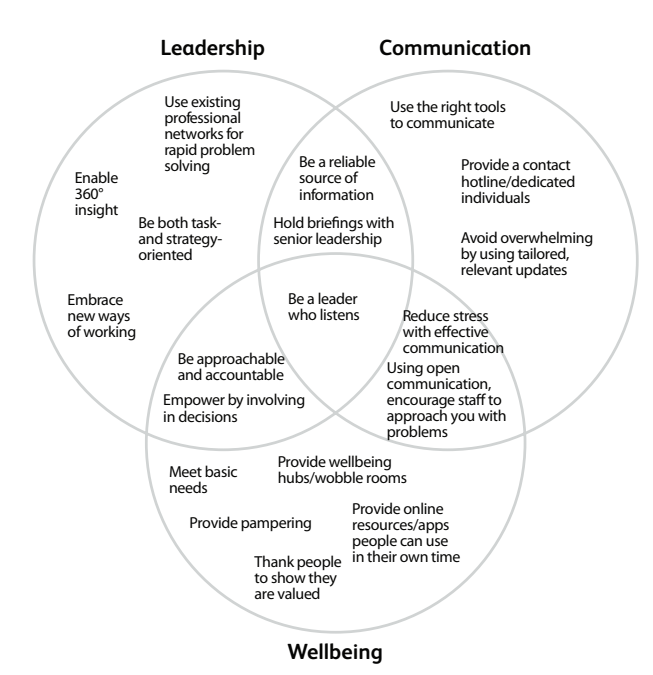
Fig 1. Overlapping domains of RCP chief registrar leadership during the COVID-19 response.