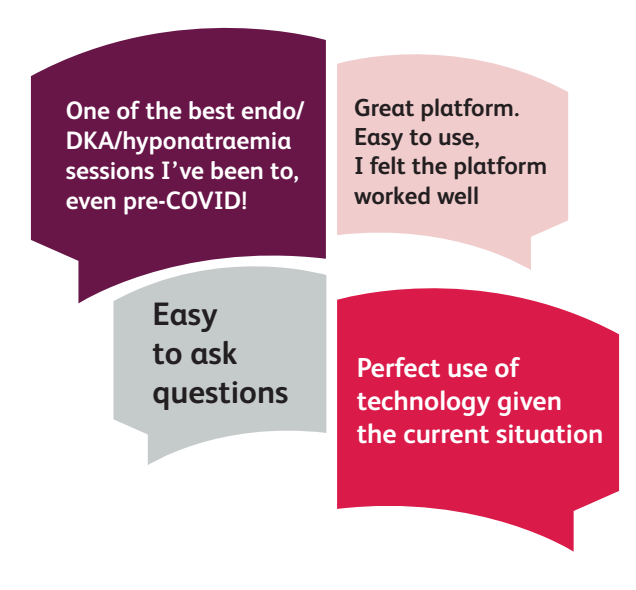
Fig 2. Examples of survey feedback to free-text questions.

We asked attendees to rate sessions overall and in the following domains: content relevance, organisation and presenter quality (Fig 1). Engagement with feedback forms was low, with 74 completed forms received – an uptake rate of approximately 15%. Respondents were from a variety of different specialties, with foundation, GP, medical and surgical trainees all represented. Feedback was very positive, with 79% of responders rating the session they attended 5/5 overall. Practical skills sessions achieved the best feedback, with 100% of attendees rating them 5/5. All sessions received positive feedback in response to the free-text questions (Fig 2).