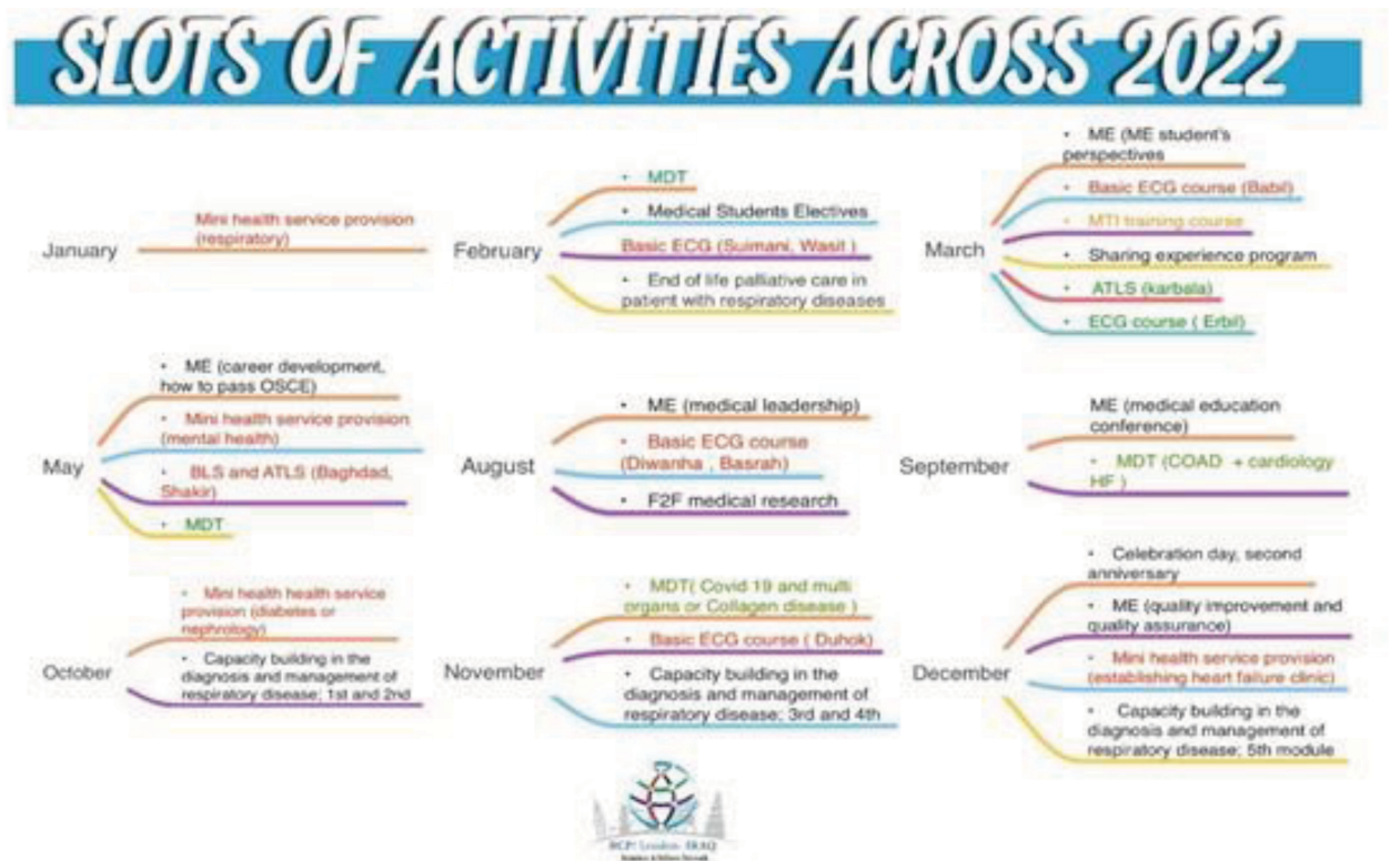
Fig 2. 2022 programme.