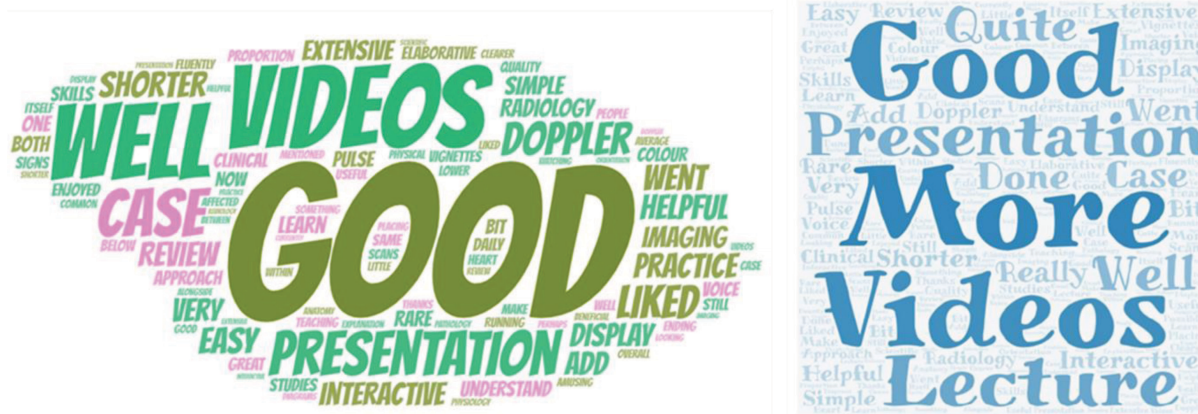
Fig 2. Qualitative feedback, WordArt representation of feedback received for the teaching course.