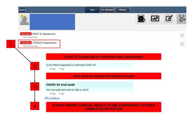
Fig 1. Individual COVID-19 assessment interface. This is accessed from the individual patient tile; once submitted the patient is automatically transferred into the live dashboard COVID-19 report.

Authors: ^intensive care and respiratory consultant, Worthing Hospital, Worthing, UK and visiting senior lecturer, University of Surrey, Guildford, UK; Banaesthetic registrar, Worthing Hospital, Worthing, UK; Canaesthetic CT3, St Richard's Hospital, Chichester, UK; Dinformatics fellow, Worthing Hospital, Worthing, UK; Fintensive care consultant, Worthing Hospital, Worthing, UK; Fintensive care consultant, Royal Surrey County Hospital Guildford, UK and professor, University of Surrey, Guildford, UK