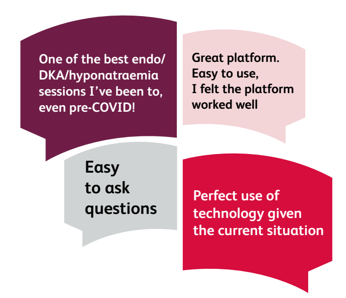
Fig 2. Examples of survey feedback to free-text questions.

We asked attendees to rate sessions overall and in the following domains: content relevance, organisation and presenter quality (Fig 1). Engagement with feedback forms was low, with 74 completed forms received – an uptake rate of approximately 15 %. Respondents were from a variety of different specialties, with foundation, GP, medical and surgical trainees all represented. Feedback was very positive, with 79\,\% of responders rating the session they attended 5/5 overall. Practical skills sessions achieved the best feedback, with 100\,\% of attendees rating them 5/5. All sessions received positive feedback in response to the free-text questions (Fig 2).